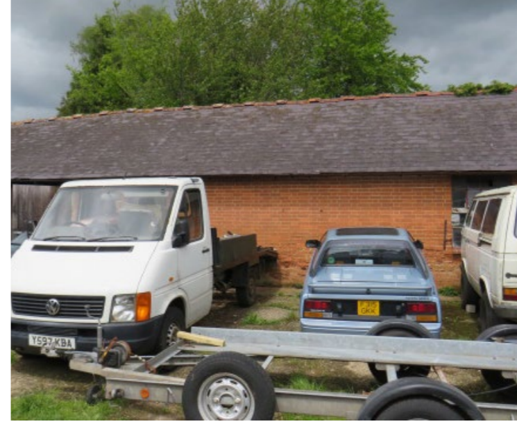
Existing Old Calf Pens Courtyard View