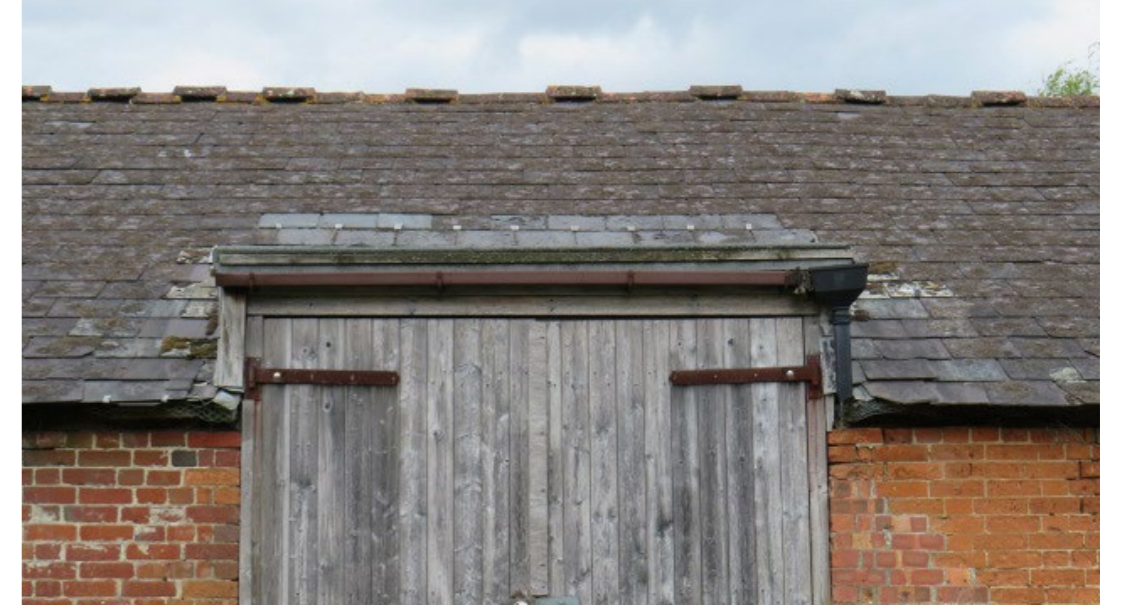
Existing Old Calf Pens