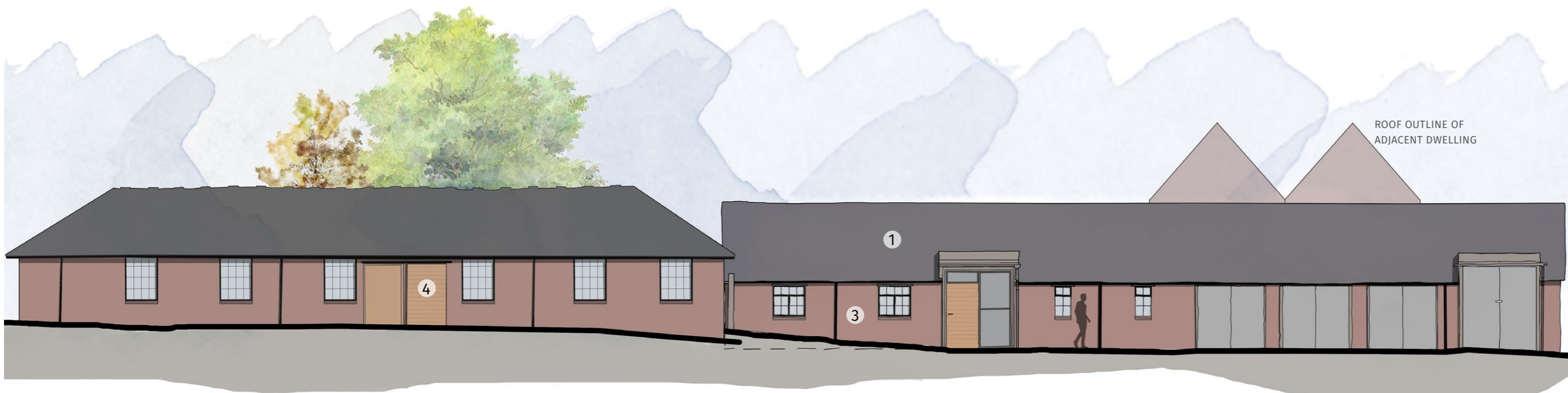
Above: Proposed Elevation 2 - Not to scale