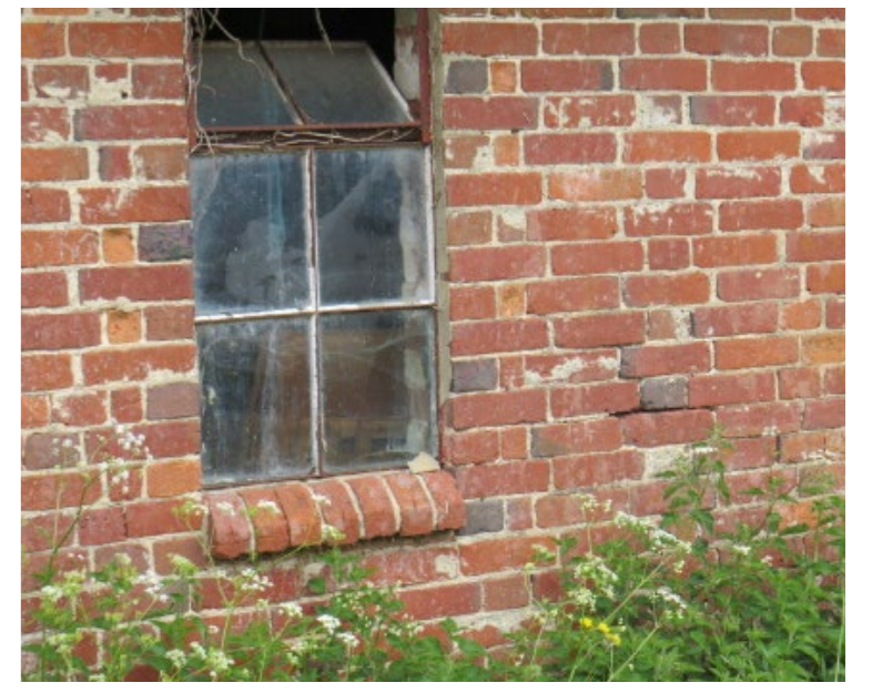
Existing Old Calf Pens