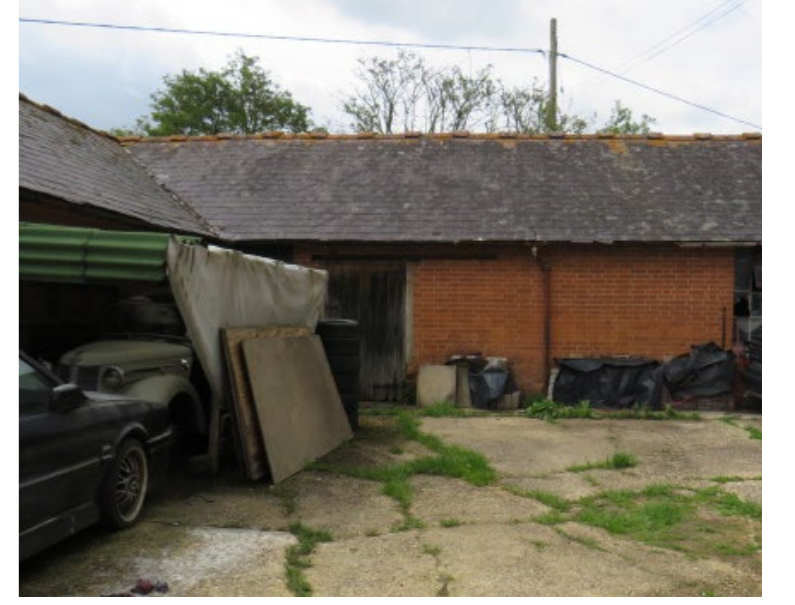
Existing Old Calf Pens Courtyard View