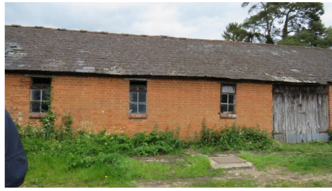
Existing Old Calf Pens