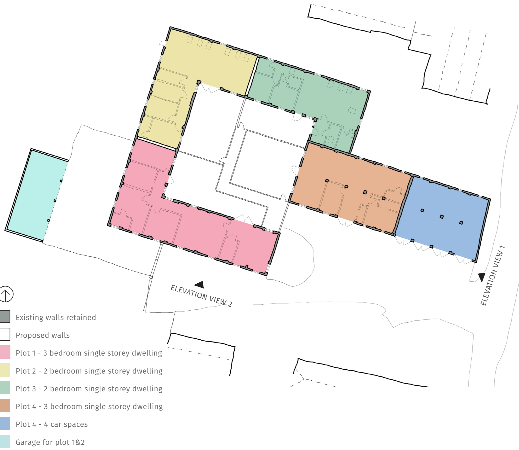
Proposed Plan - not to scale