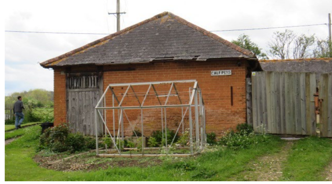
Existing Old Calf Pens Entrance View