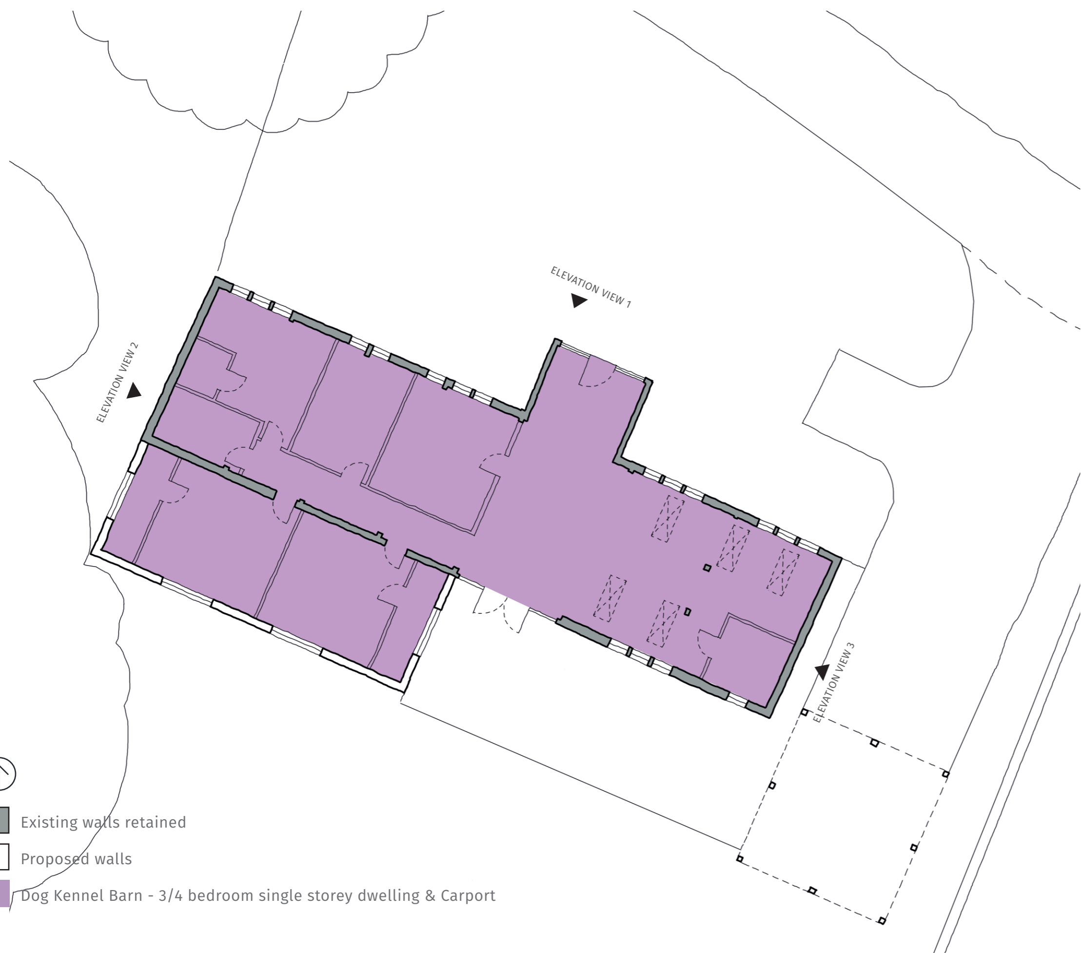
Proposed Plan - not to scale