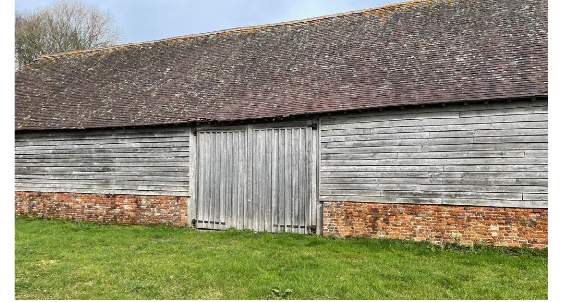
Existing Dog Kennel Barn Rear View