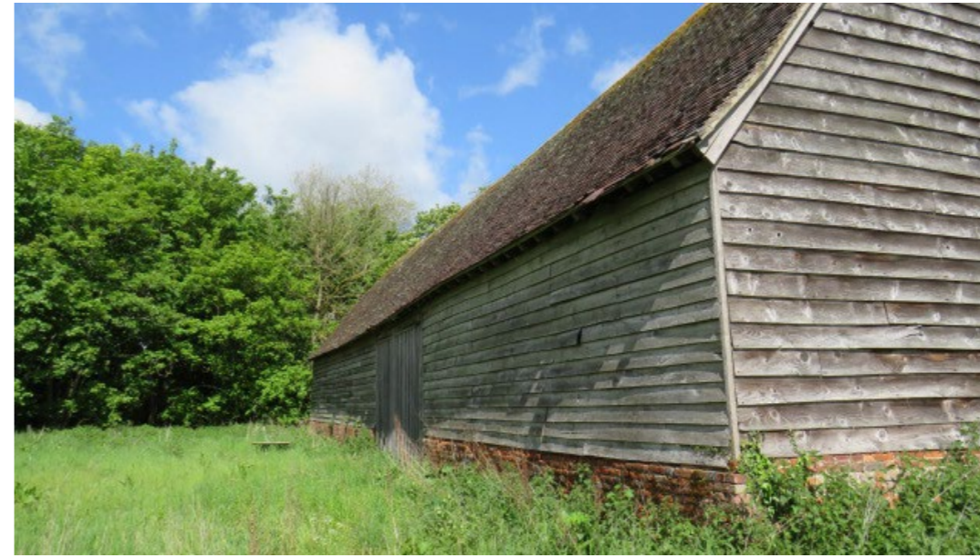
Existing Dog Kennel Barn Rear View