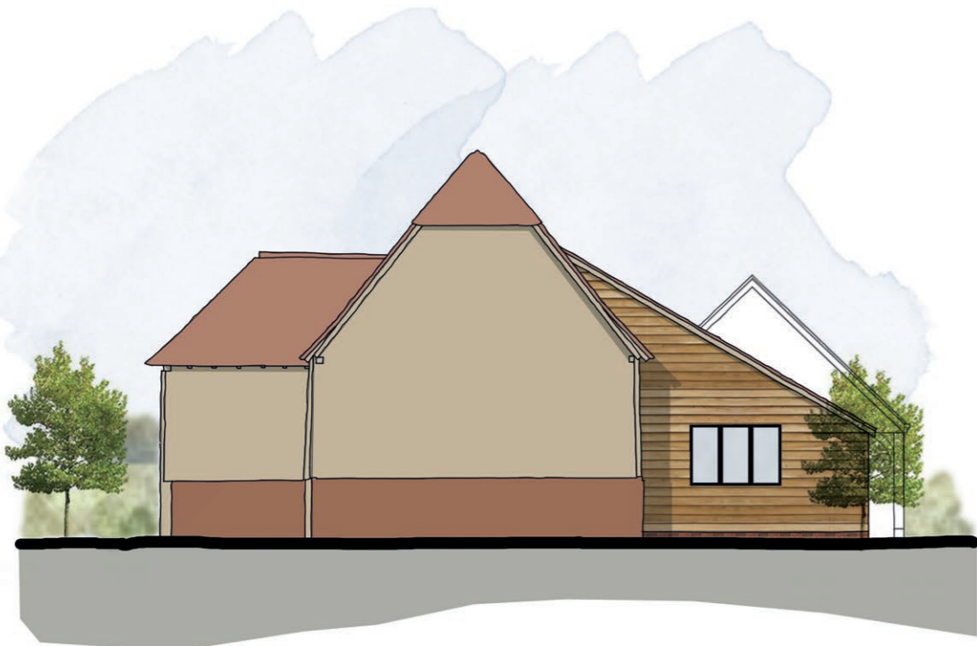
Above: Proposed Elevation 2 - Not to scale