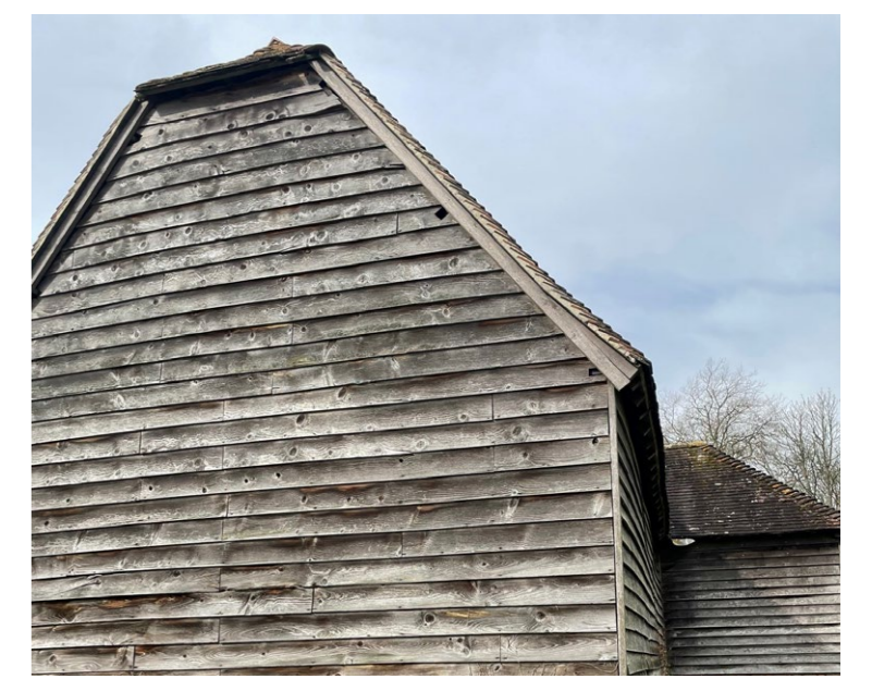
Existing Dog Kennel Barn Side View