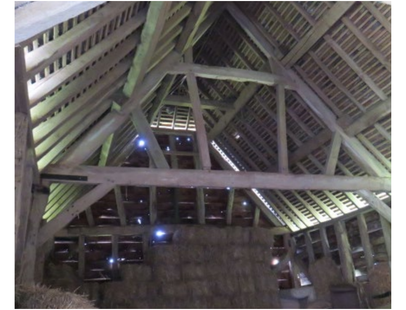
Existing Dog Kennel Barn Internal View