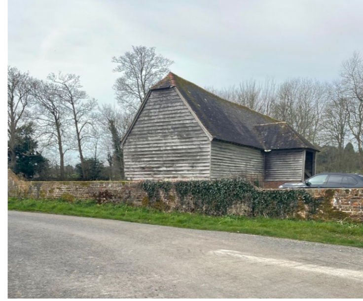
Existing Dog Kennel Barn Road View