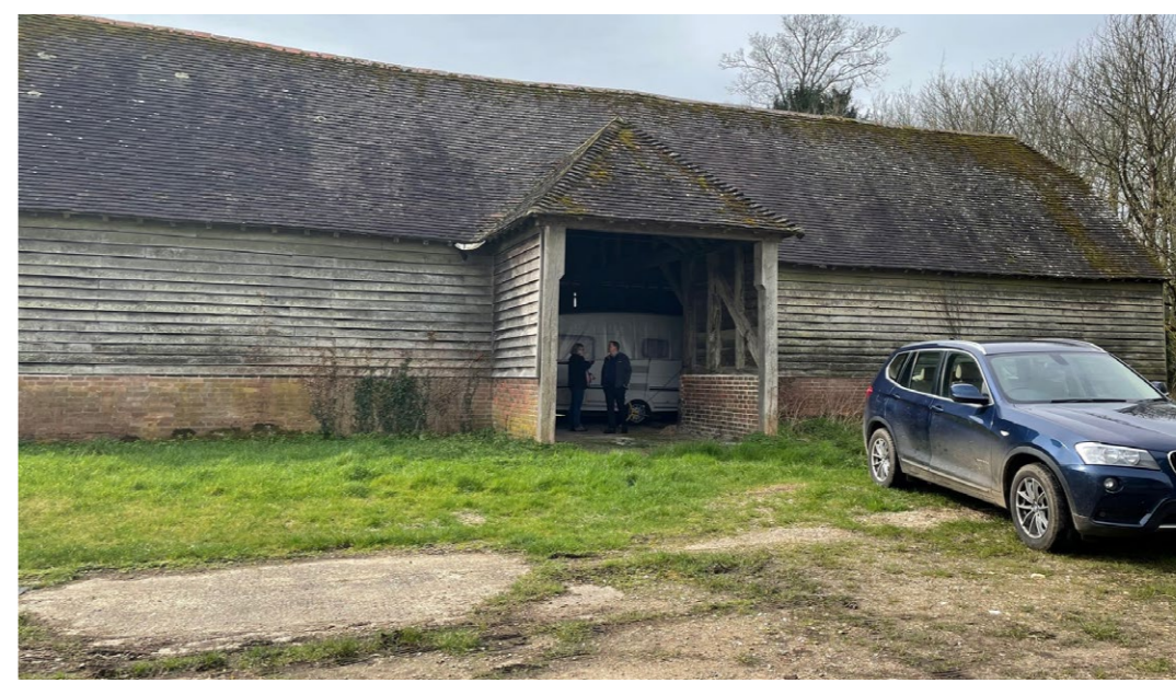
Existing Dog Kennel Barn Front View