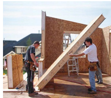
EXAMPLES OF PRE-FABRICATED COMPONENTS BEING ASSEMBLED ON SITE