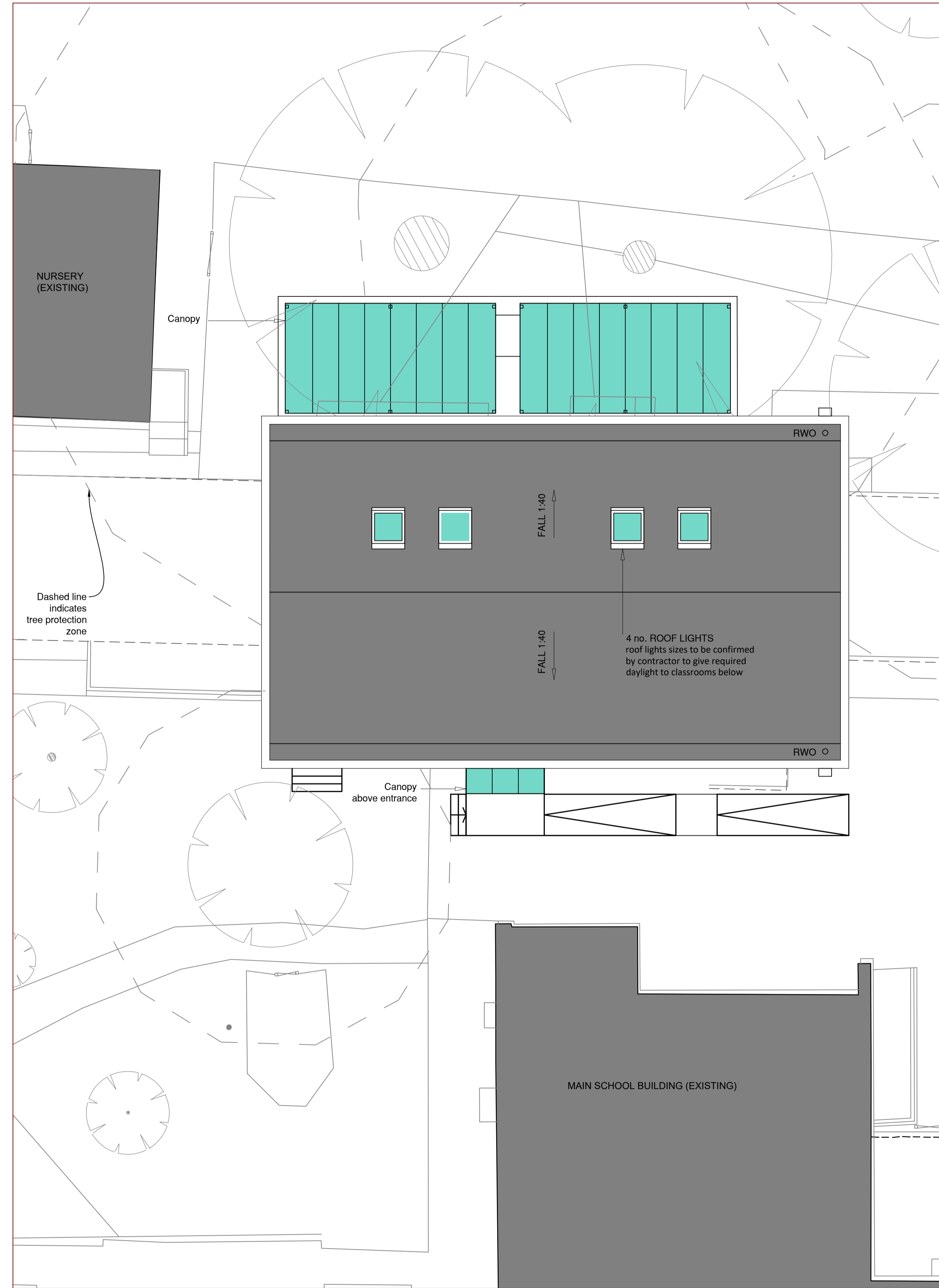
2 PROPOSED ROOF PLAN 1:100 SCALE 1:100